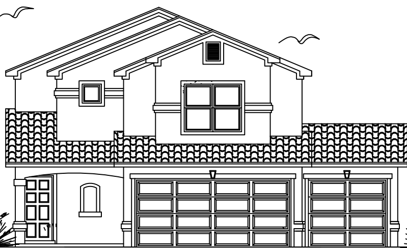
FRONT ELEVATION B