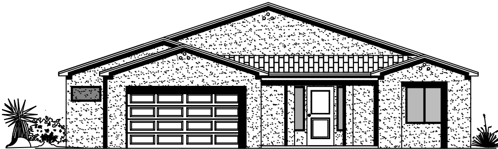
PITCHED FRONT ELEVATION