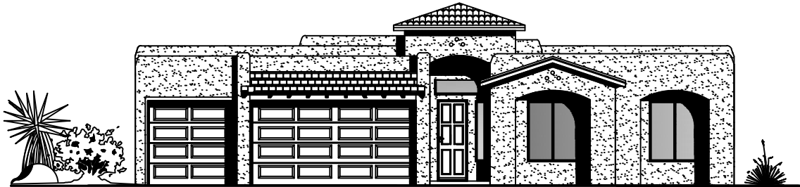
FLAT ROOF FRONT ELEVATION