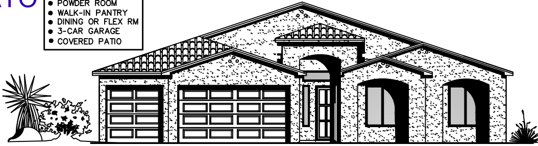
PITCHED FRONT ELEVATION