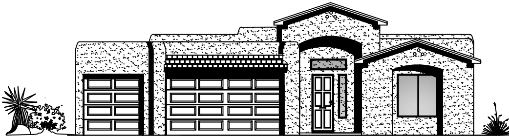
FLAT ROOF FRONT ELEVATION